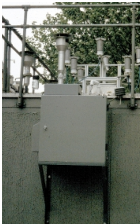
Figure 1 continued on page 2 Low volume sampler (roof-top) and Partisol 2025 PM 10 monitoring methods at Marylebone Road, London

Consequently there is a great deal of European activity in these areas over the last few years, much of which is ongoing such as comparisons between measurement methods at Marylebone Road (Figure1).